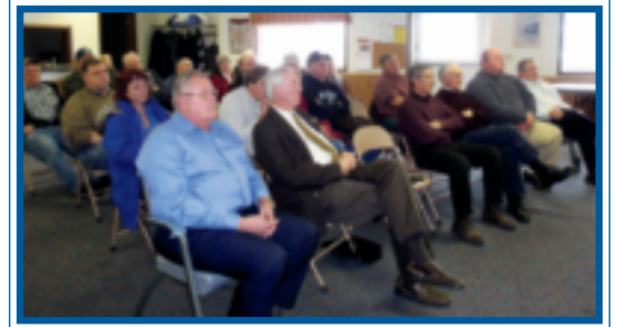
District 5 Meeting